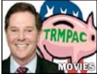
Can This Film Hurt Tom DeLay?