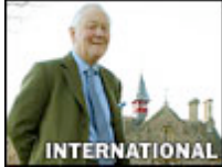
Englishman Seeks Heir in America