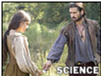
Pocahontas Speaks Again