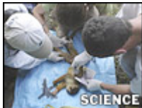
Rain Forest Gets Too Much Rain